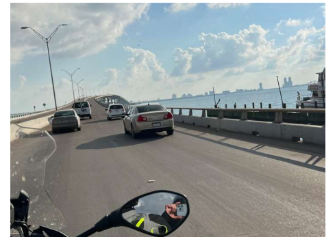
Leaving South Padre Island

It was morning rush hour as we rode through McAllen and Harlingen. The traffic was thick! At one point, there was a traffic jam. The GPS routed us around it in the nick of time! According to Garmin, it saved us 40 minutes! Yay! Once we made it over to I-69 south, it was smooth sailing to Hwy 100 down to South Padre Island. The Mexican border was done! No problems or even any unusual activity was noticed, but we did see a lot of border patrol vehicles scouting along the border area.