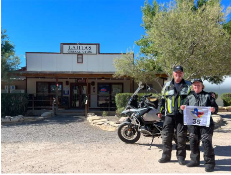
Lajitas General Store

We continued on into Big Bend National Park to Panther Junction Visitor Center for another mandatory photo. It was 98 degrees! Fortunately, the humidity was low that made for comfortable riding.