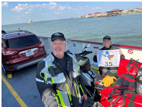
Galveston Bay Ferry

The fourth and final mandatory picture is required as you are riding the ferry across Galveston Bay to the Bolivar Peninsula. It was hot as we waited in line to board the ferry. But, once we were on, it was pleasant as we crossed the bay.