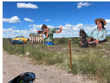
James Dean "Giant"