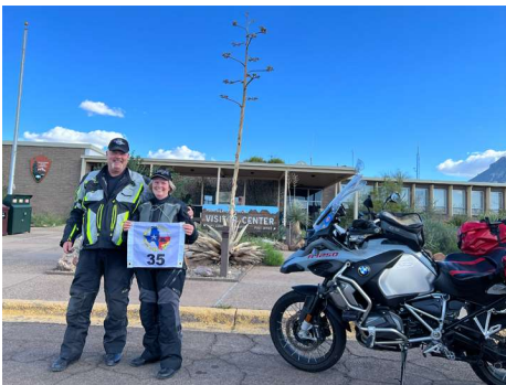
Big Bend Panther Junction

We continued on into Big Bend National Park to Panther Junction Visitor Center for another mandatory photo. It was 98 degrees! Fortunately, the humidity was low that made for comfortable riding.