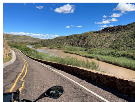
River Road (Hwy 170)

We rode right along the Rio Grande River through mountains and canyons on this curvy, hilly two-lane road! It was awesome! Unlike most roads, this was three-dimensional with the up and down hills along with the curves. The beautiful scenery really adds to this awesome road. Definitely one of our favorite roads!